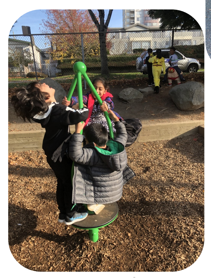
Students enjoying our new Curva Spinner on the playground.

There are still Golden Gala apples available! $5 for a 5lb. bag! Please drop by the office if your interested in purchasing them.